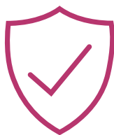
The Right to Safety