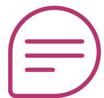
The Right to Voice Your Opinion

Learn more about your loved one's rights