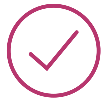
The Right to Choose