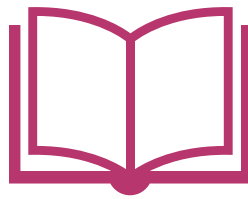
The Right to Be Informed