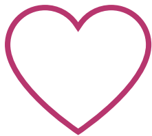
The Right to Receive Compassionate Care

You have the right to choose the care your loved one receives. While a physician might make recommendations, your loved one always has the following rights: