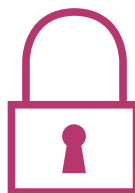
The Right to Privacy